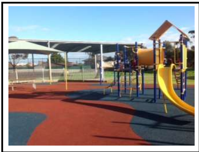
Primary Years Playground

Overall our grounds projects are reaping rewarding and pleasant results for the school community as a whole.