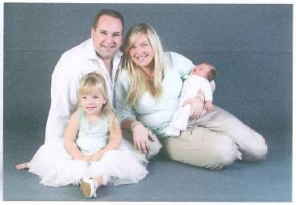
$15 per digital image or 4 images for $35

$10 from each session sold will be donated to the school Minimum deposit with booking $15.00